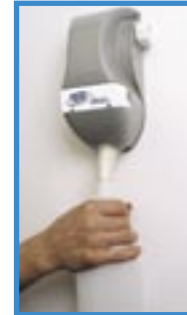
Hands-Free Bottle Fill